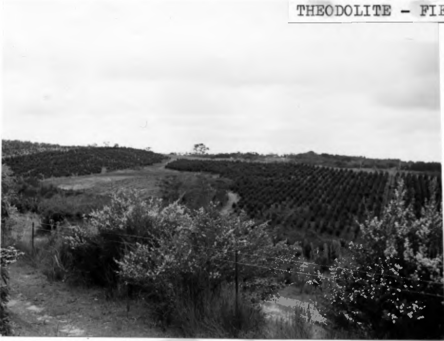
TYPICAL COUNTRY ENCOUNTERED ON THE SURVEY TRAVERSE