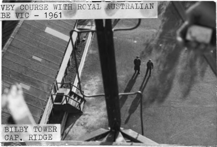
VIEW OF CAMP FROM BILBY TOWER COL. HERRIDGE & CAP. RIDGE