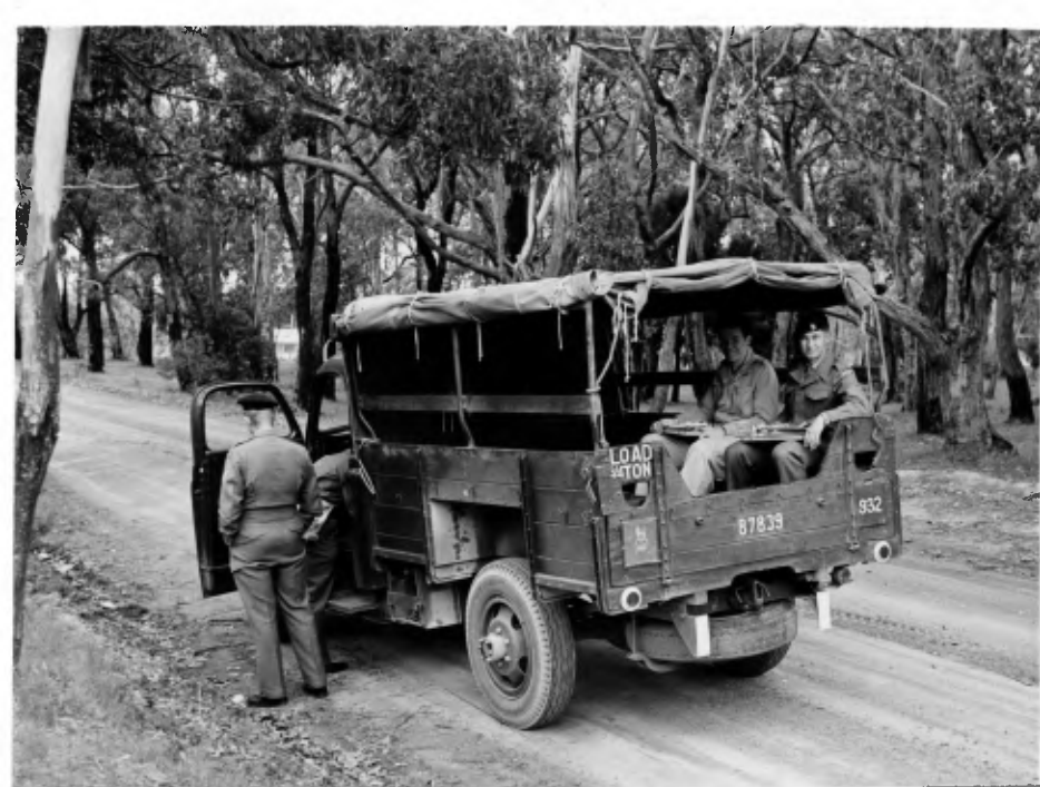
TOWARDS FLINDERS & HASTINGS LEAPFROG BAROMETER HEIGHTING EXERCISE