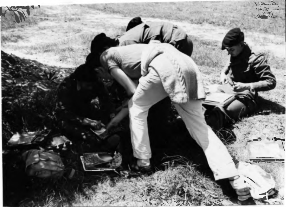
FIELD ANNOTATING AERIAL PHOTOS ALLOCATION OF AREAS TO BE COVERED INDIVIDUALLY