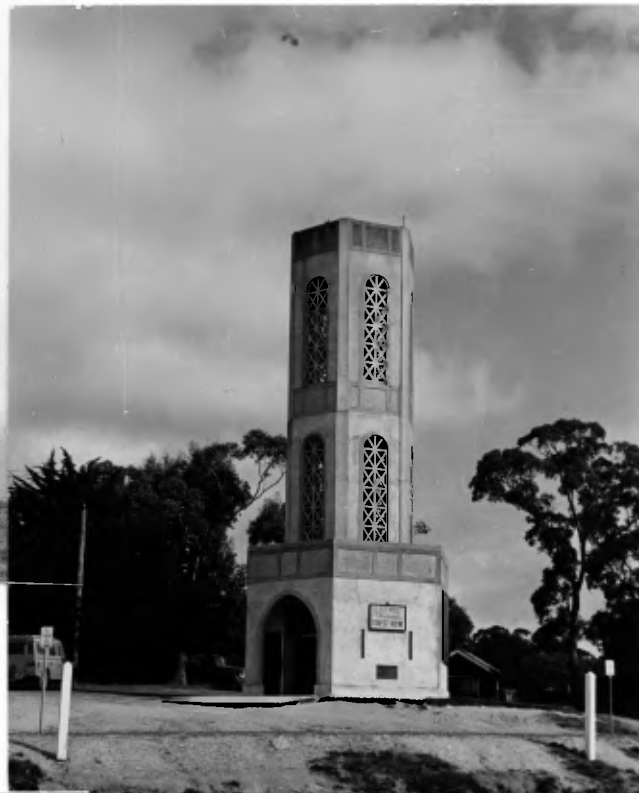
ARTHUR SEAT TOWNER TRIG STN