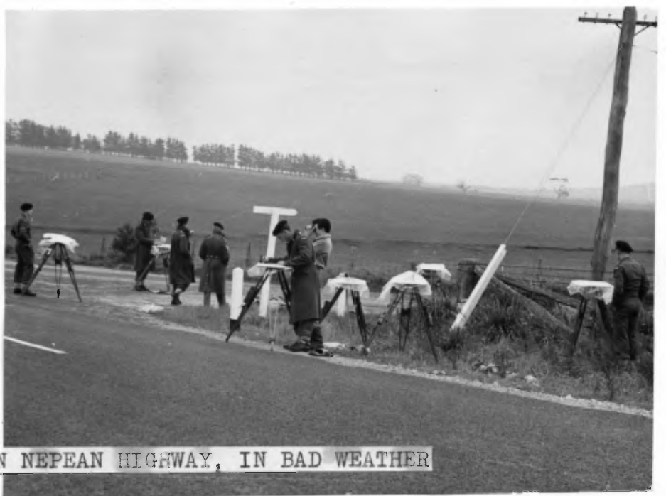
PLANE TABLING ON NEPEAN HIGHWAY, IN BAD WEATHER