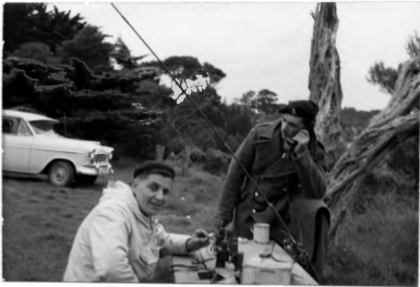
SORRENTO BASE - HELIOGRAPH ABANDONED DUE TO BAD WEATHER, COMMUNICATIONS WITH ARTHUR SEAT AND MT MARTHA WERE ESTABLISHED BY WIRELESS