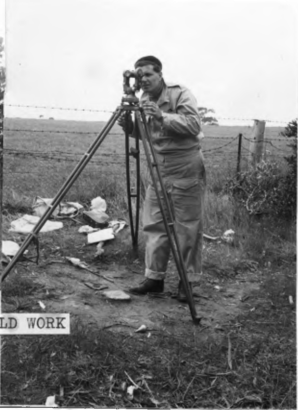
THEODOLITE - FIELD WORK