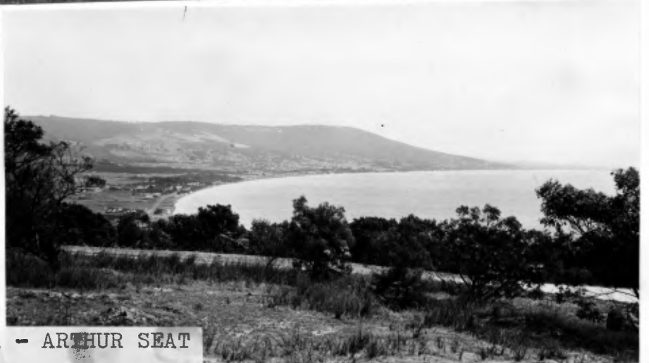
VIEW OF SAFETY BEACH - DROMANA - ARTHUR SEAT FROM MT MARTHA