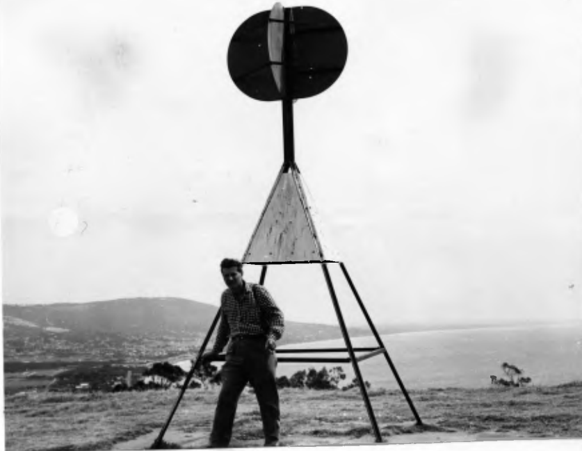
MT MARTHA NO. 2 TRIG STN