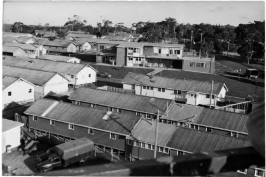
CANTEEN & SHOP, MESS & SAPPERS QUARTERS