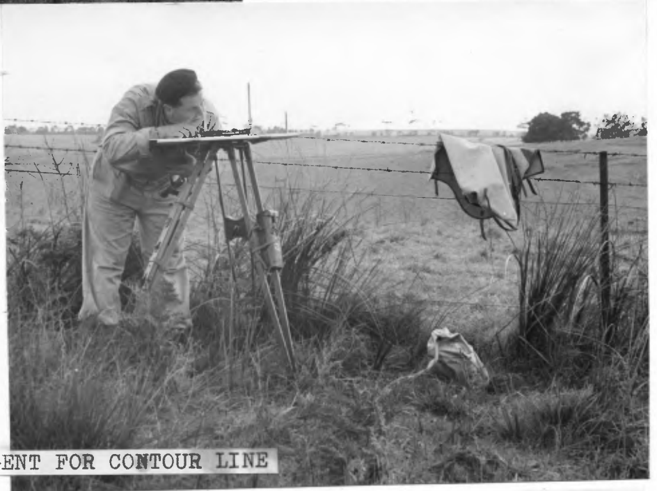
READING THE TANGENT FOR CONTOUR LINE