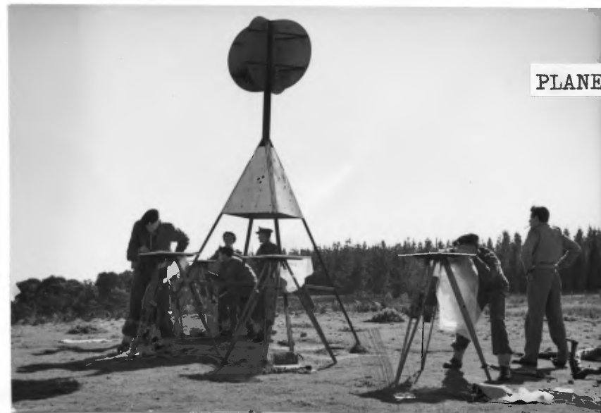
PLANE TABLING ON MT MARTHA NO. 2