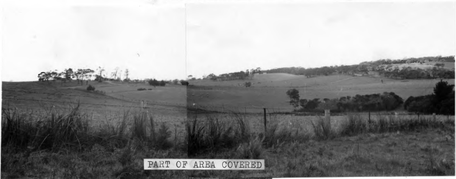
PART OF AREA COVERED