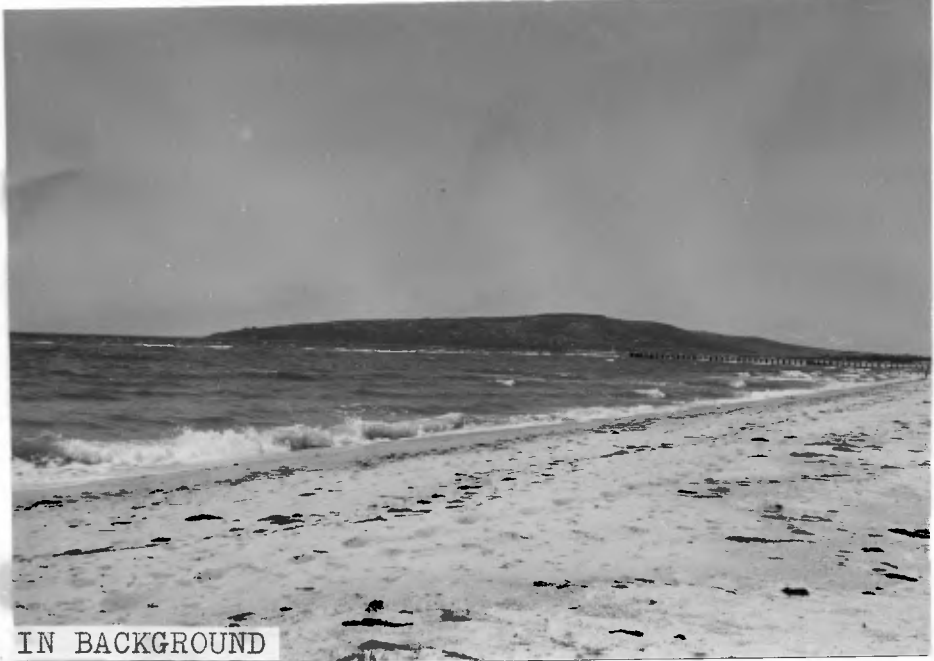
SAFETY BEACH - MT MARTHA IN BACKGROUND