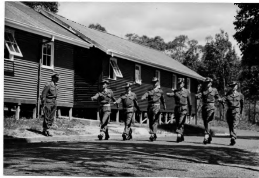
... SATURDAY MORNING DRILL ... UNDER THE DIRECTION OF W/OFF. O'NEILL