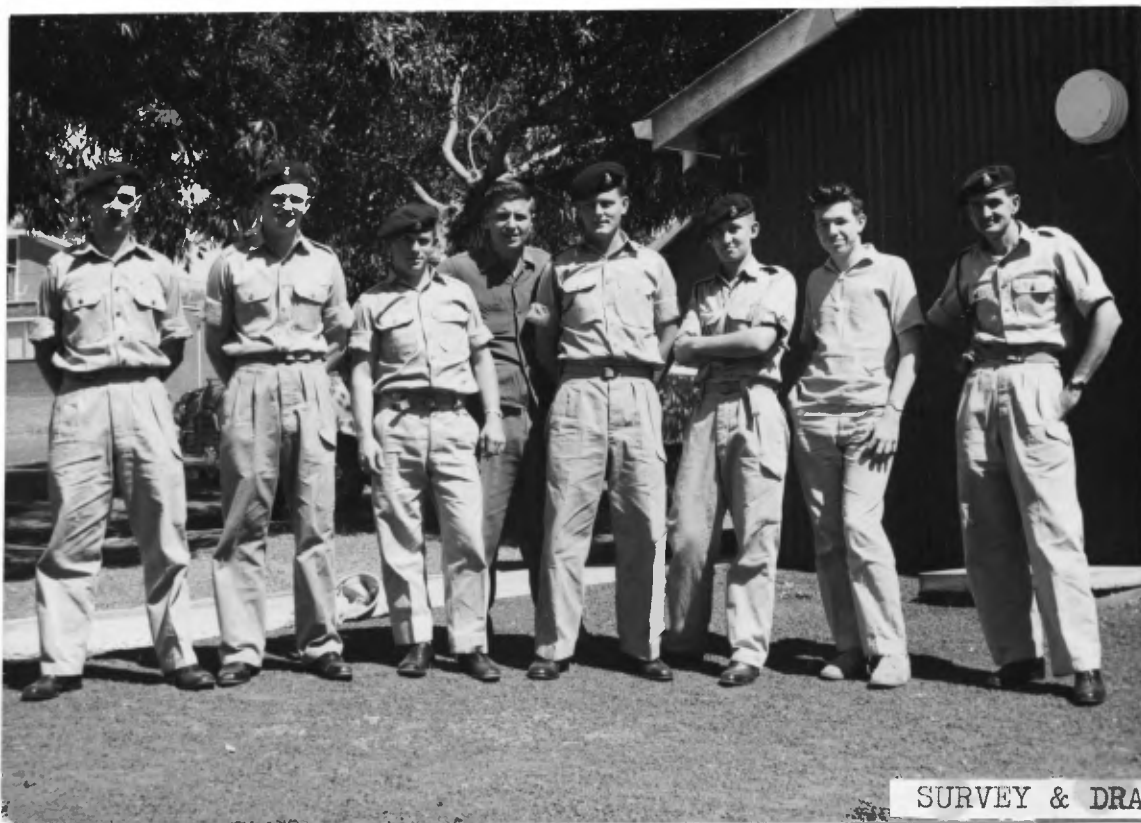
SURVEY & DRAFTING COURSES