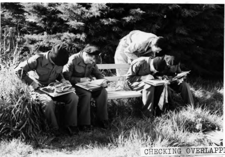
CHECKING OVERLAPPING AREAS